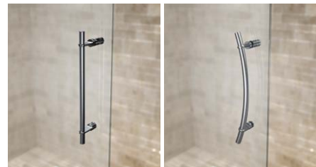
Straight (1) Shown in Bright Chrome