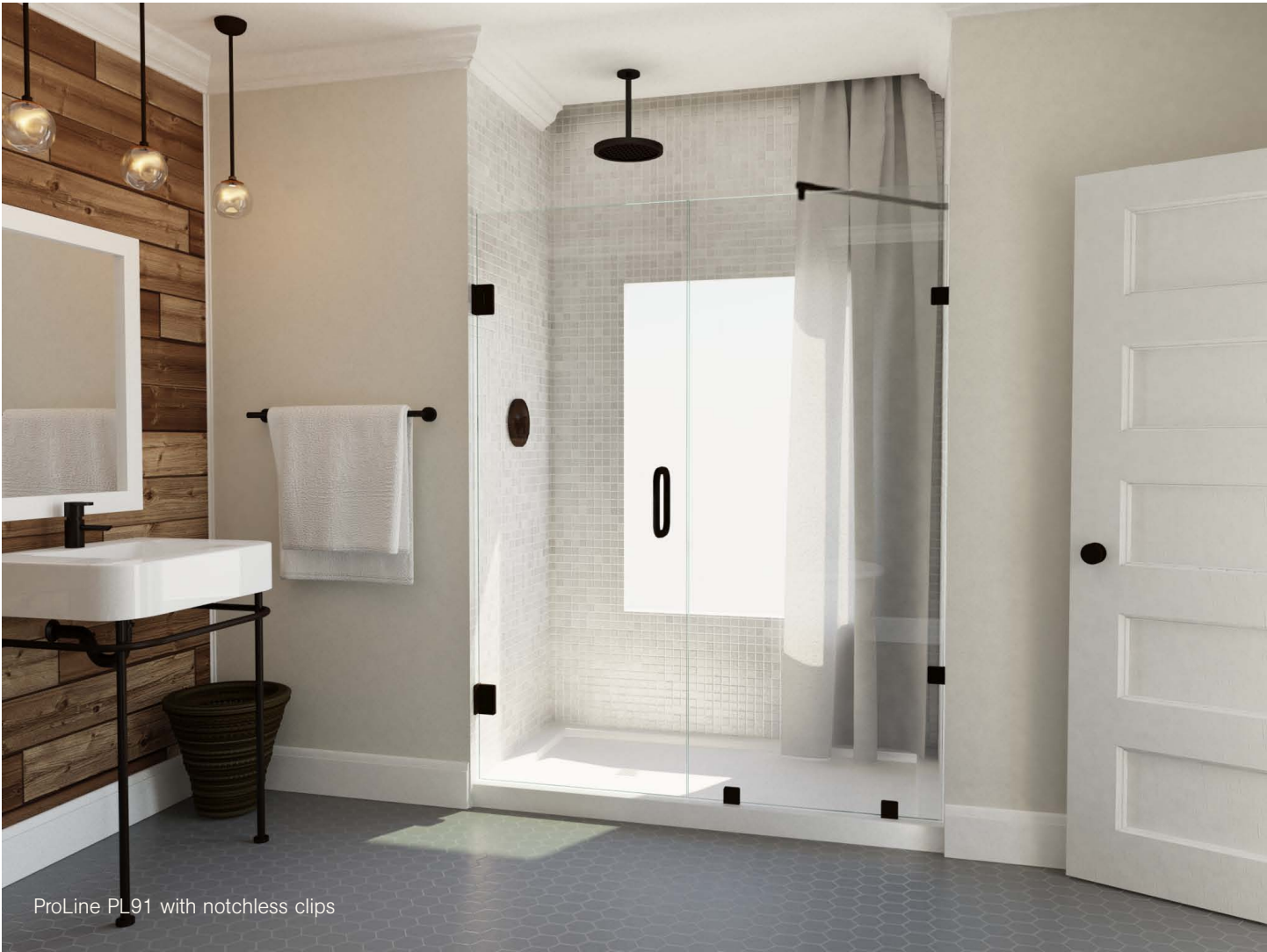
ProLine PL91 with notchless clips