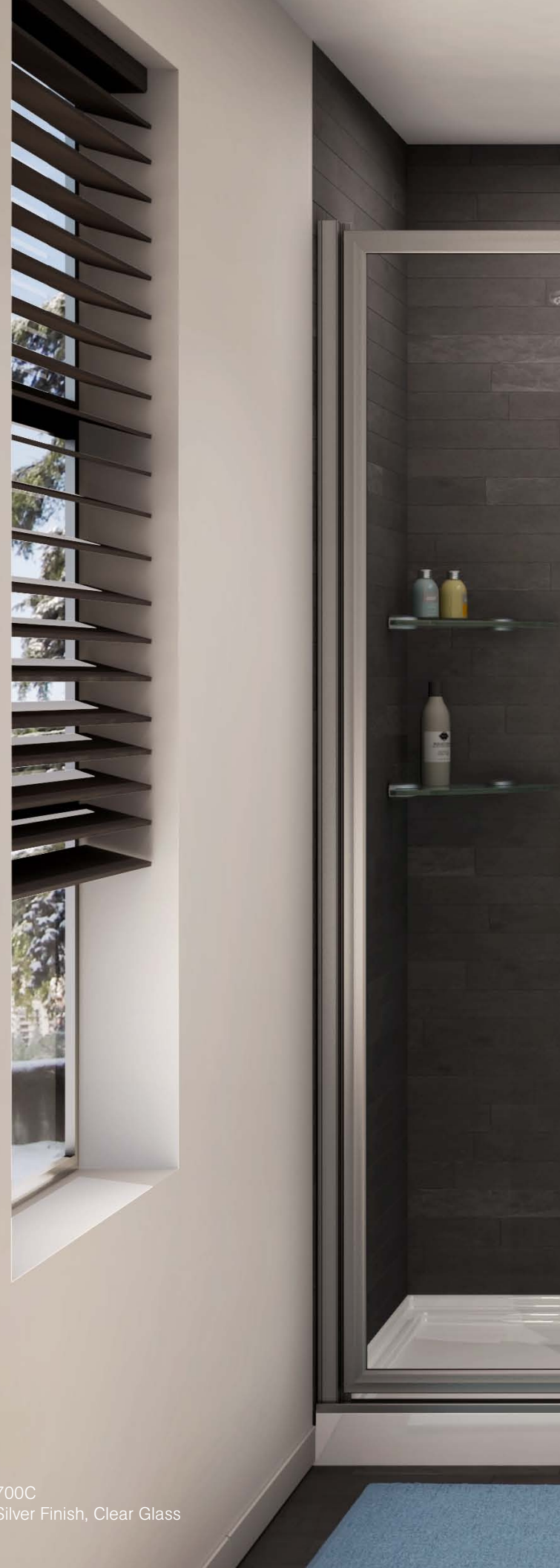
700C Silver Finish, Clear Glass