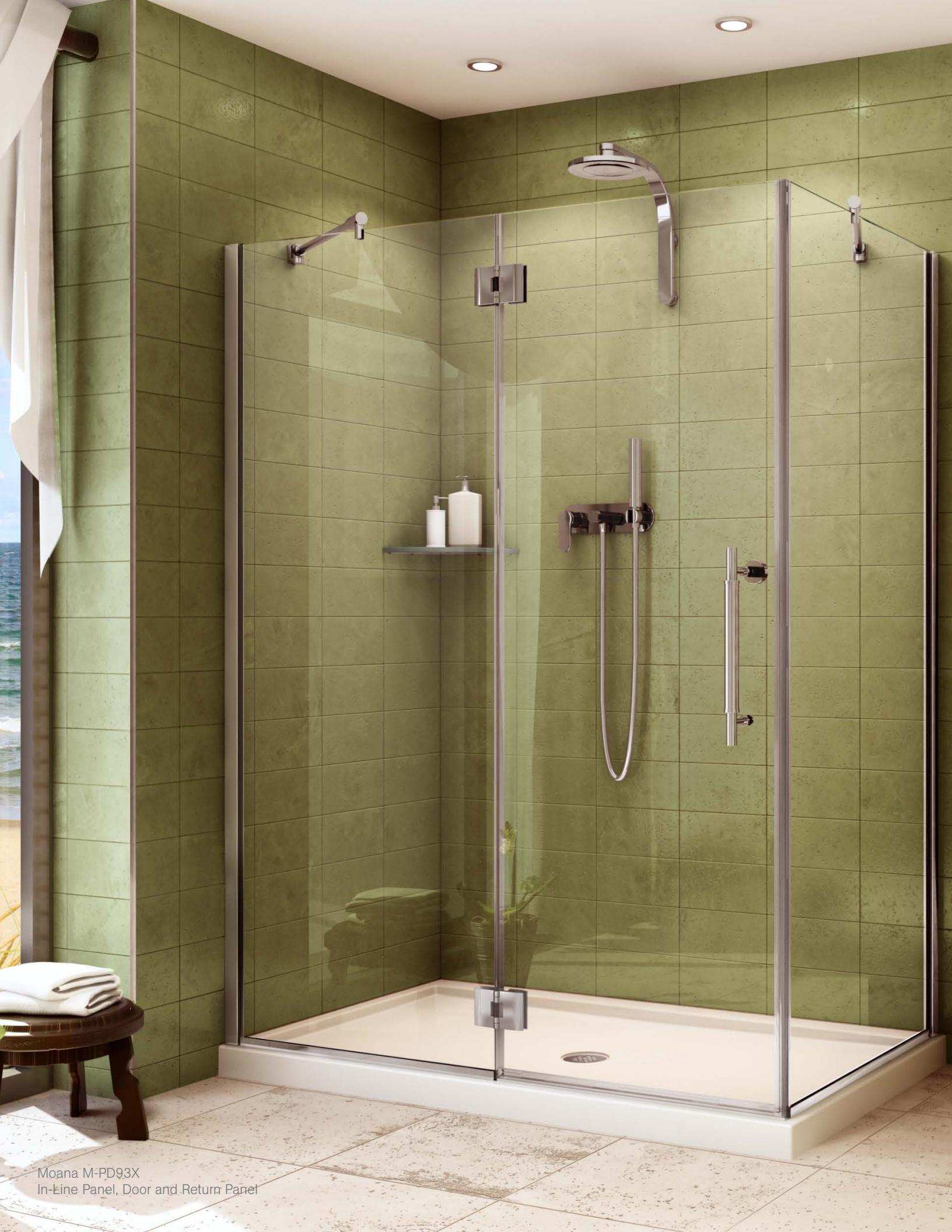
Moana M-PD93X In-Line Panel, Door and Return Panel