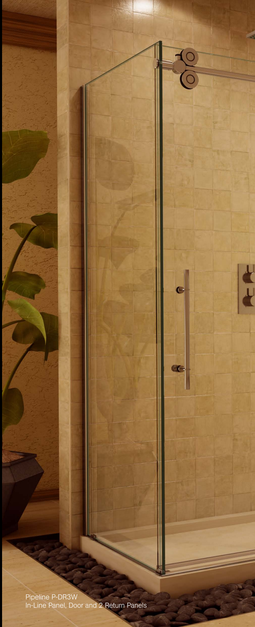
Pipeline P-DR3W In-Line Panel, Door and 2 Return Panels

Available in multiple configurations, Pipeline brings ultimate luxury to any bath.