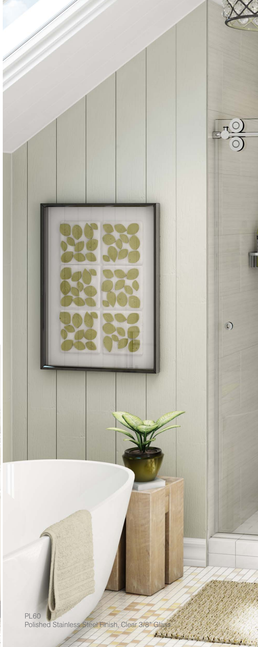
PL60 Polished Stainless Steel Finish, Clear 3/8" Glass