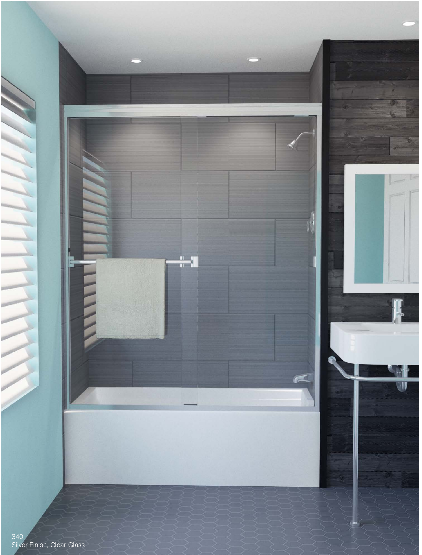
340 Silver Finish, Clear Glass