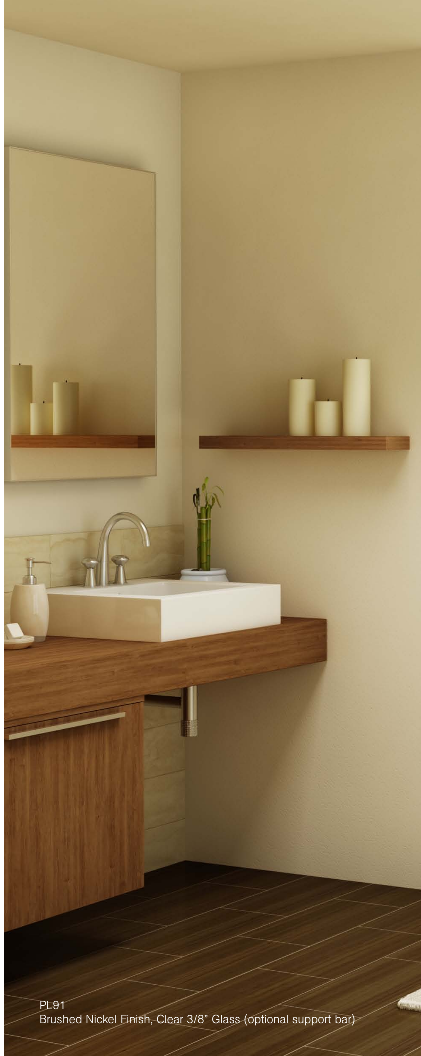
PL91 Brushed Nickel Finish, Clear 3/8" Glass (optional support bar)