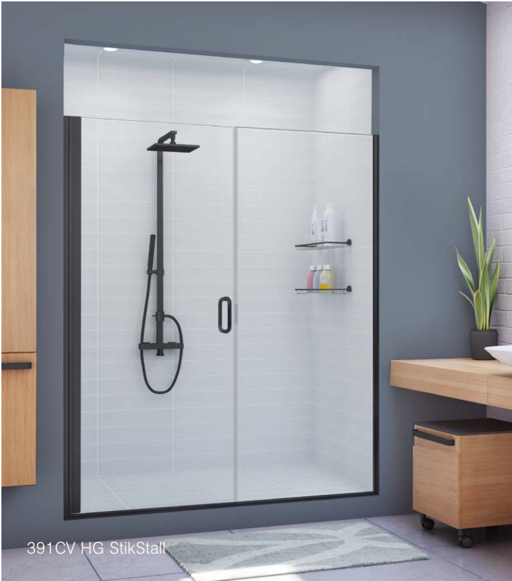
391CV HG StikStall