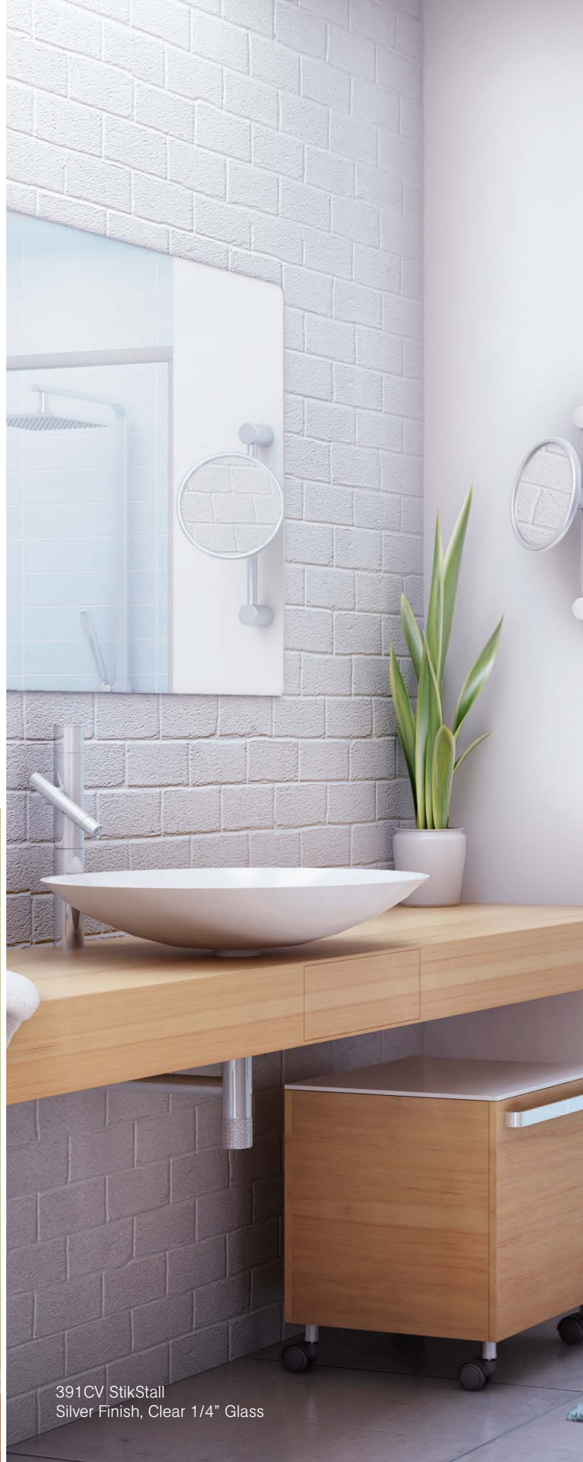
391CV StikStall Silver Finish, Clear 1/4" Glass