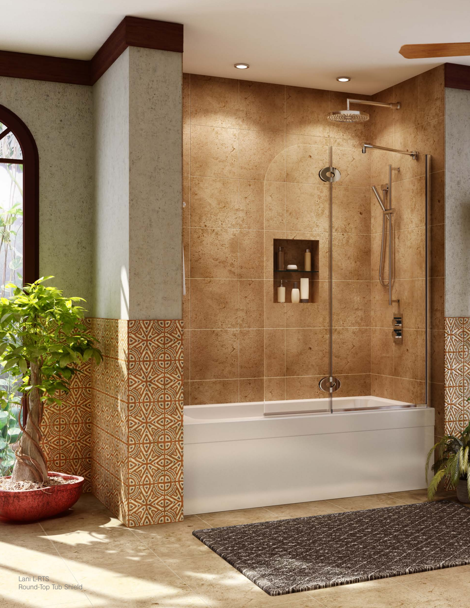
Lani L-RTS Round-Top Tub Shield